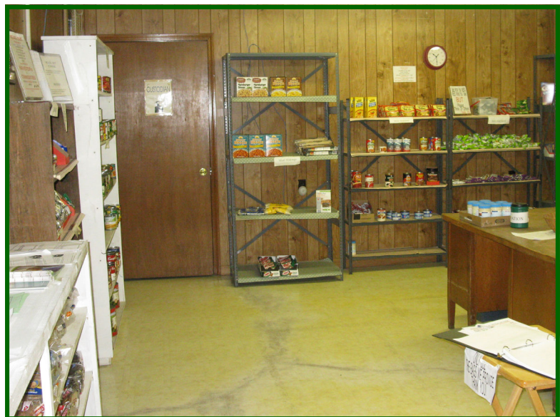
Reach Out Prescott UMC sponsored community food pantry